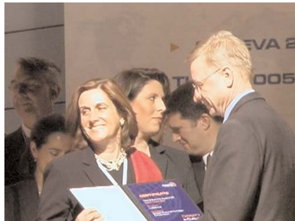
Franz Morak , Secretary of State for the Arts and Media, Austria hands over the certificates in the category e-culture