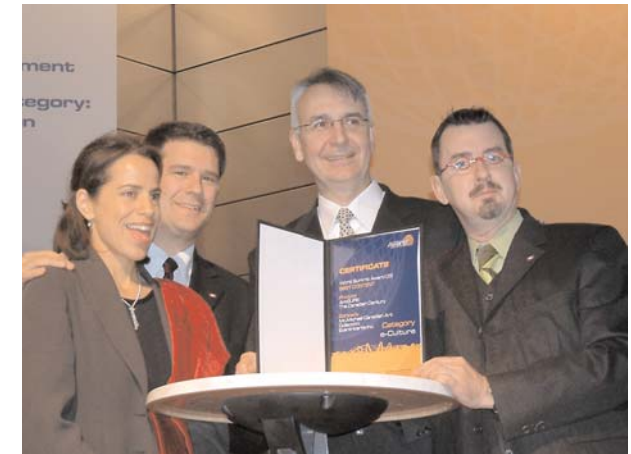
The team of "Art2Life" from Canada receives a "WSA Best e-Content" certificate