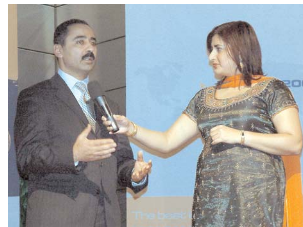
Montassar Ouaili , Secretary of State to the Minister of Communication Technologies and Transport, Tunisia