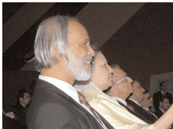
Begum Khaleda Zia and her entourage enjoy the showcase event