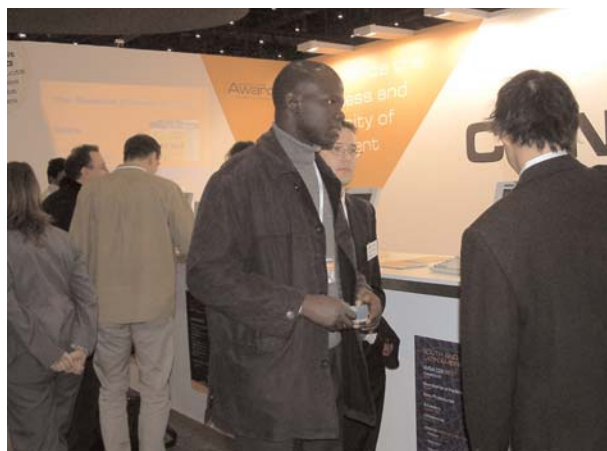
A glimpse of the WSA Exhibition Stand at the ICT4D Platform