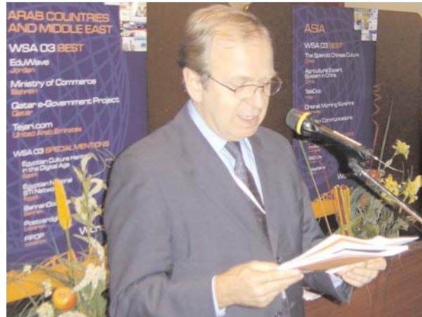
Erkki Likanen , European Commissioner for Enterprise and Information Society