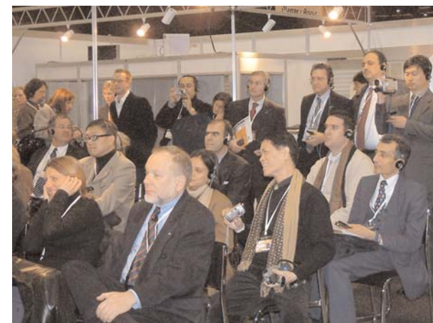
Journalists at the World Summit Award Press Conference