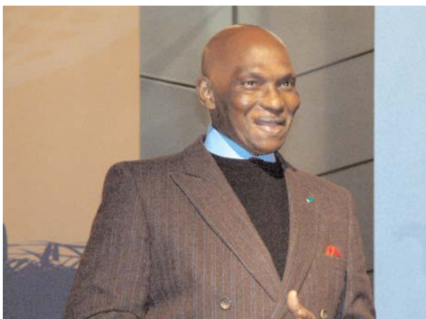
Abdoulaye Wade , President of Senegal