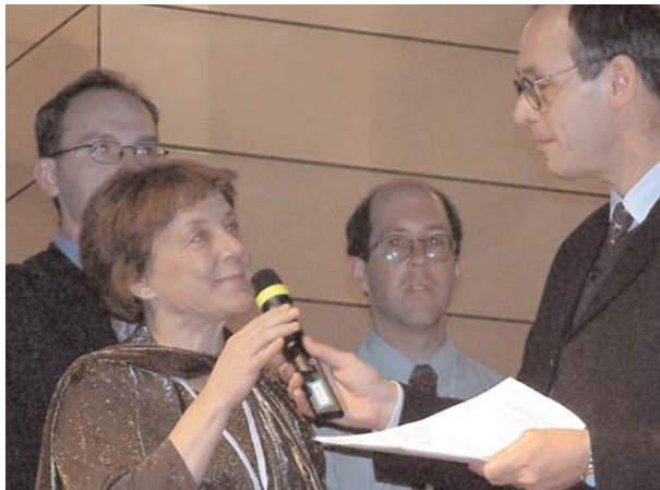
The team of "Timehunt" was among 5 selected in the category e-Entertainment