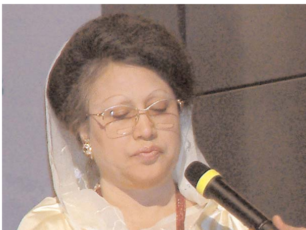
Begum Khaleda Zia , Prime Minister of the People's Republic of Bangladesh