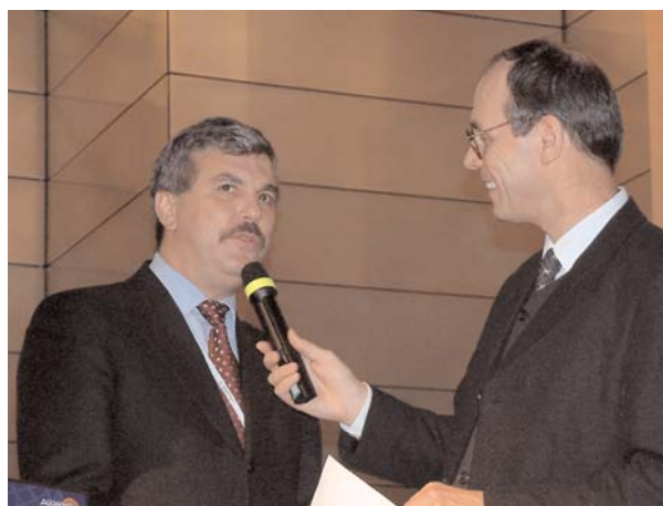
Dan Nica , Minister of Communications and Information Technology, Romania