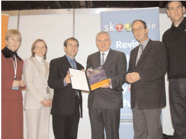
Mary Hanafin T.D. , Minister for the Information Society, Ireland and Bertie Ahern , Taoiseach (Prime Minister) of Ireland with the team of "school.ie"