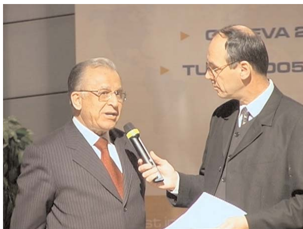
Ion Iliescu , President of Romania