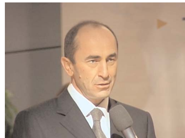
Robert Kocharian , President of the Republic of Armenia