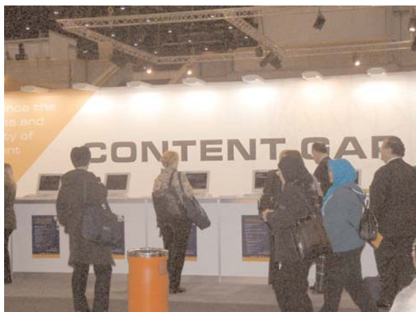
The WSA Exhibition Stand was one of the most visited stands due to the immense variety of projects presented there