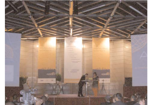
The stage of the World Summit Award Showcase Event