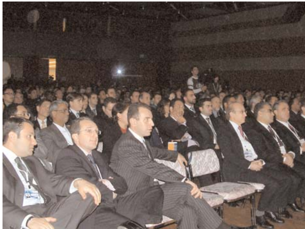
Over 500 guests from all over the globe enjoy the showcase