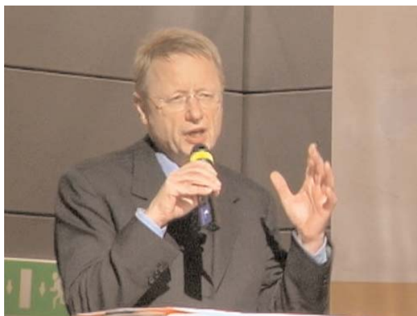
Franz Morak , Secretary of State for the Arts and Media, Austria