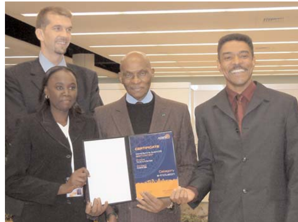
Abdoulaye Wade with the producers of "Time to Market" from Senegal