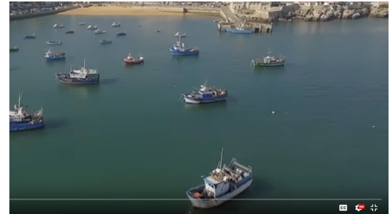
WSA GLOBAL CONGRESS CASCAIS BEST-OF VIDEO