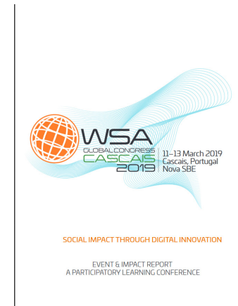
WSA GLOBAL CONGRESS CASCAIS VENT REPORT