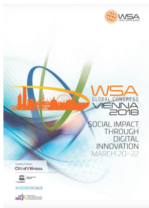
WSA GLOBAL CONGRESS PROGRAM