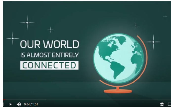
ABOUT THE WSA VIDEO