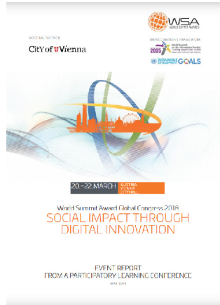
WSA GLOBAL CONGRESS VIENNA EVENT REPORT